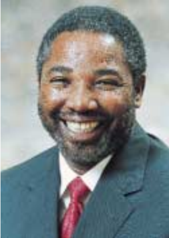
Minister C. Nqakula

I present the sixth Annual Report of the Independent Complaints Directorate and the first under my leadership.